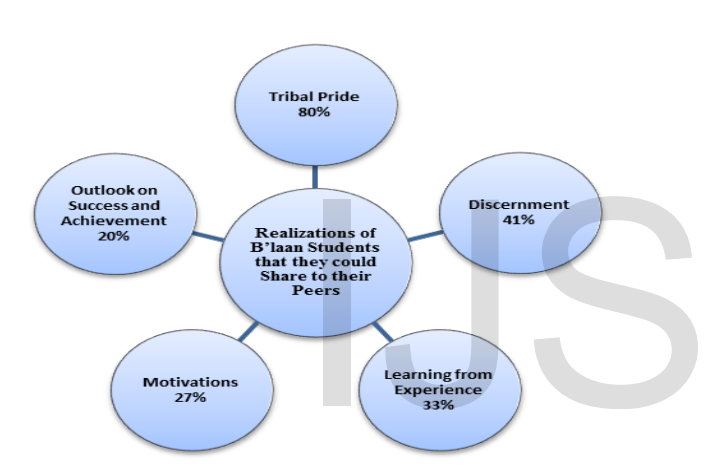
Figure 3. Major Themes on Realizations of B'laan Students that they could Share to their Peers

As shown in Figure 3, realizations of the B'laan students came out because of tribal pride (80%), discernment (41%), learning from experience (33%), motivations (27%), and outlook on their success and achievement (20%).